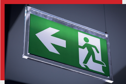
Emergency and safety lighting

SSB Battery covers all market requirements with a range of battery series with a wide variety of applications.