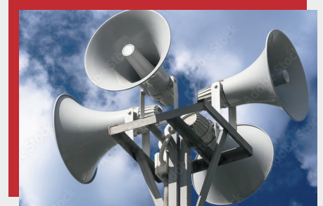
VAS and EPA systems