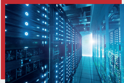
UPS and CPS systems